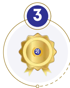
Best Teacher of the year