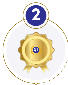
Best Principal of the year