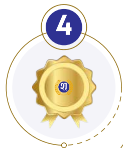
Parents of the year