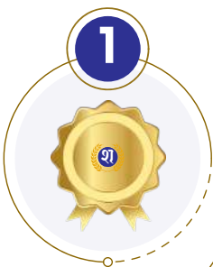
Best Institution of the year