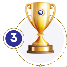
“The Rising Star” Scholarship Class 11 th & 12 th